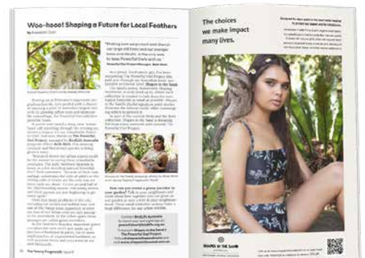
Editorial campaign and full page ad