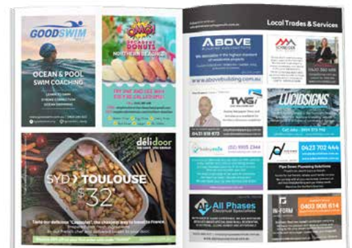
Quarter, half and eighth page ads