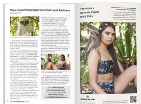
Editorial campaign and full page ad