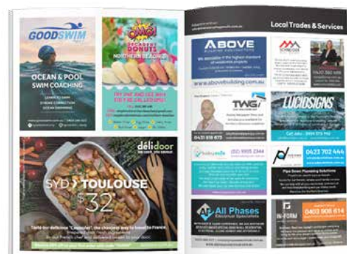
Quarter, half and eighth page ads